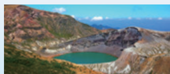
Okama - Crater Lake -